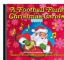
A Football Fan's Christmas Carols