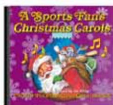
A Sports Fan's Christmas Carols