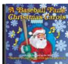
A Baseball Fan's Christmas Carols