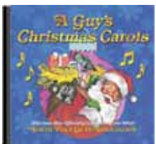
A Guy's Christmas Carols