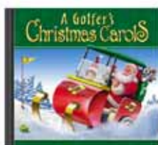
A Golfer's Christmas Carols